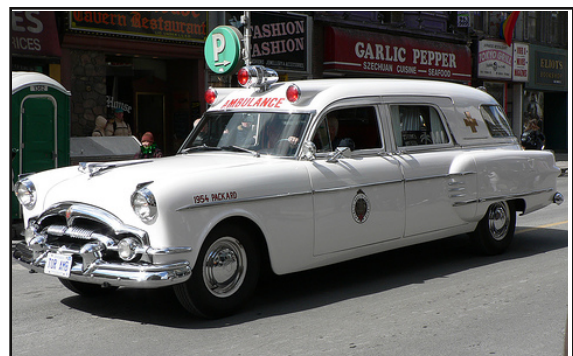
1954 Packard Station Wagon Ambulance

Did you know that the first known organized fire brigade dates back to 24 BC? The Roman Emperor, Augustus, instituted a corps of watchmen to keep the city in check for fires. If a fire did break out, the best way to fight it was with buckets of water being passed from hand to hand until it reached the fire. They also used axes to make openings for the heat to escape and to prevent the spread of the fire. Another tool used was long hooks attached to ropes. These were used to take down buildings that might be in the path of a fire in order to stop the fire from spreading. It wasn't until the early 19th century that water pumped through hoses was used to fight fires!