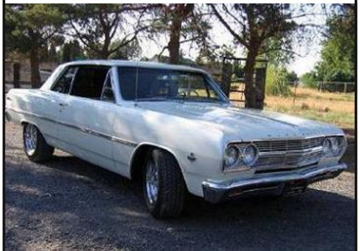
Rob T's 1965 Chevrolet Malibu