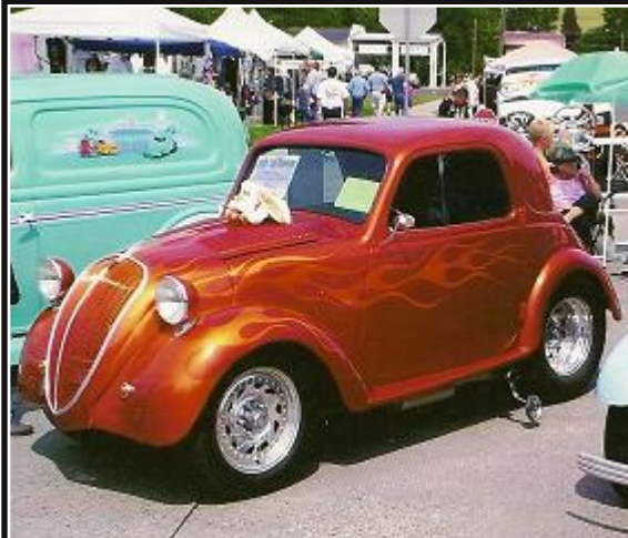
A FORD ANGLIA