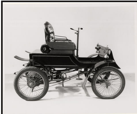
1901 Pierce Motorette

This automobile has a 3½-horsepower De Dion Bouton single-cylinder, water-cooled engine bearing the number 3008.